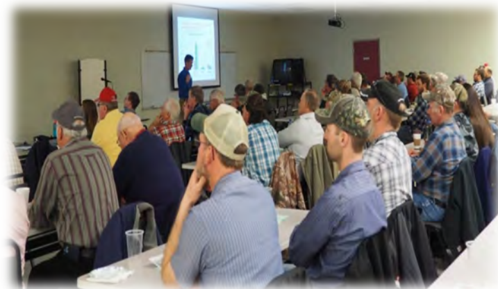
The annual Adams County Soil Quality Meeting is always well attended by the conservation-minded ag community.

Implementation of the county's CAP can help achieve multiple local, state, and bay-wide objectives. It may also have numerous positive outcomes like encouraging and enhancing communication with stakeholders, promoting a think-outside-the-box mindset, implementing pilot studies that promote ingenuity and enhance understanding of the practicality of various practices, streamlining requirements across multiple programs, and removing barriers to on-the-ground implementation.