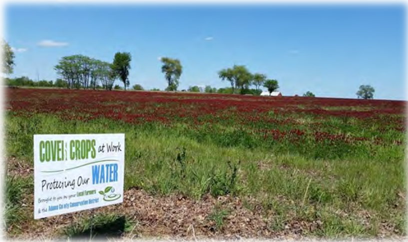
Cover crops are essential to Adams County soil and water quality and are strongly supported by the ag community in Adams County. Pictured above are educational signs placed on local farms that cover cropped.

First, programmatic changes are a priority that recommend statewide activities that are needed to facilitate the implementation of this plan's recommendations. Reporting and tracking are essential to understanding what is already on the ground (establishing an accurate baseline) and tracking Best Management Practices (BMPs) implementation and water quality conditions