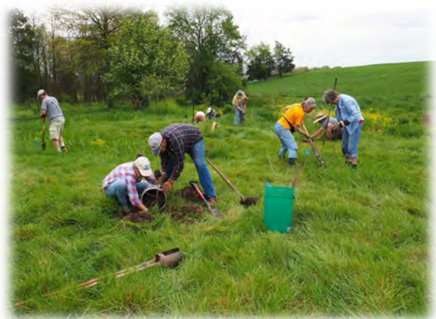
Local volunteers planting riparian buffers.