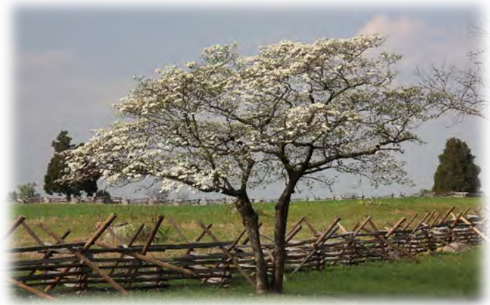
Adams County is home to the Historic South Mountain Fruit Belt produces more apples than any county in the Commonwealth.

More details on each of these actions are provided in the attached templates and technical appendix.